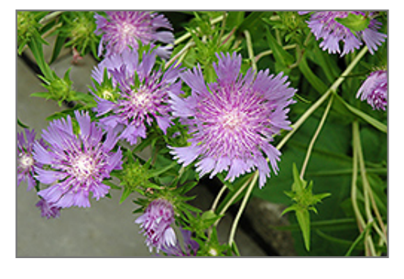
Stoke's Aster flowers