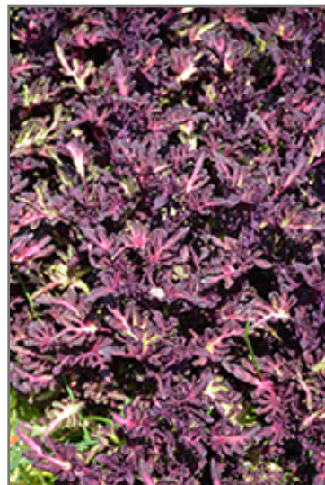
Merlin's Magic Coleus foliage