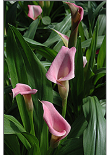
Lipstick Calla Lily flowers

Lipstick Calla Lily will grow to be about 12 inches tall at maturity extending to 24 inches tall with the flowers, with a spread of 24 inches. When grown in masses or used as a bedding plant, individual plants should be spaced approximately 18 inches apart. It grows at a medium rate, and under ideal conditions can be expected to live for approximately 10 years. As an herbaceous perennial, this plant will usually die back to the crown each winter, and will regrow from the base each spring. Be careful not to disturb the crown in late winter when it may not be readily seen!