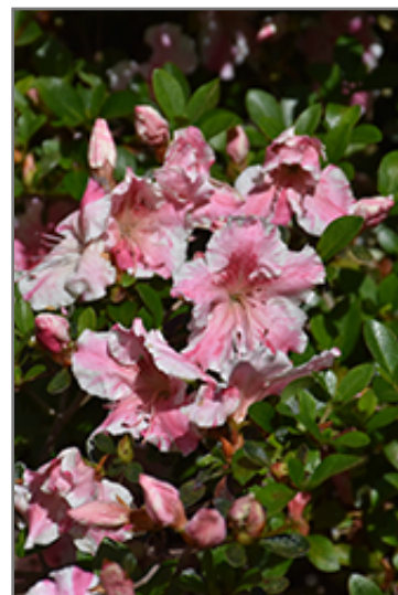
Encore Autumn Sunburst Azalea flowers