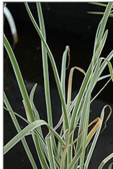
Variegated Society Garlic foliage

* This is a 'special order' plant - contact store for details