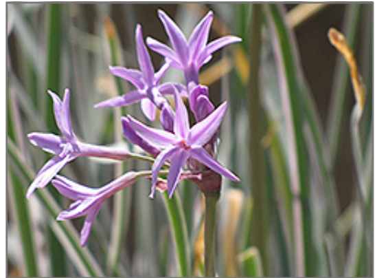
Variegated Society Garlic flowers

Variegated Society Garlic features showy spikes of violet star-shaped flowers with pink overtones rising above the foliage from mid spring to late summer. The flowers are excellent for cutting. Its attractive grassy leaves remain light green in color with prominent white stripes and tinges of silver throughout the season.