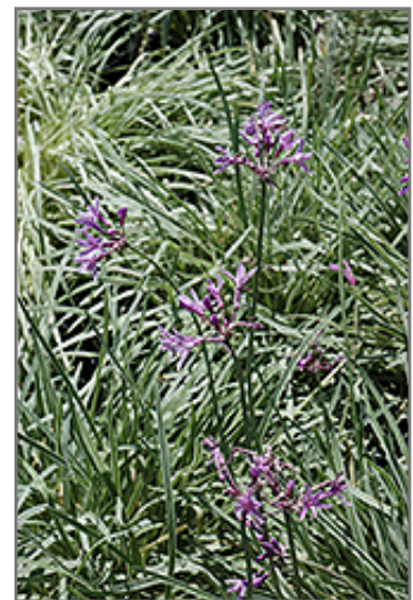
Variegated Society Garlic flowers