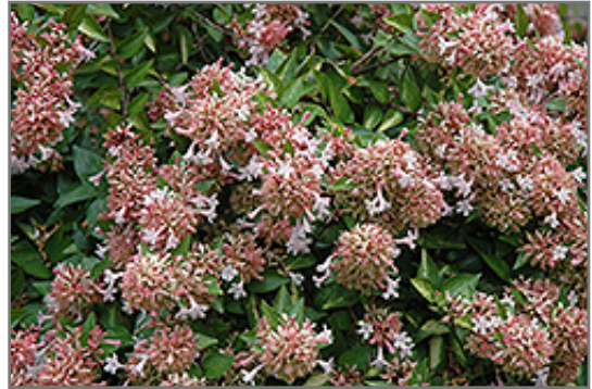
Canyon Creek Abelia flowers

Canyon Creek Abelia makes a fine choice for the outdoor landscape, but it is also well-suited for use in outdoor pots and containers. Because of its height, it is often used as a 'thriller' in the 'spiller-thriller-filler' container combination; plant it near the center of the pot, surrounded by smaller plants and those that spill over the edges. It is even sizeable enough that it can be grown alone in a suitable container. Note that when grown in a container, it may not perform exactly as indicated on the tag - this is to be expected. Also note that when growing plants in outdoor containers and baskets, they may require more frequent waterings than they would in the yard or garden.