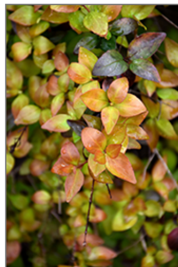
Canyon Creek Abelia foliage