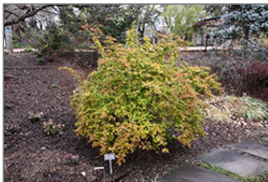
Canyon Creek Abelia

Canyon Creek Abelia is a multi-stemmed evergreen shrub with a mounded form. Its average texture blends into the landscape, but can be balanced by one or two finer or coarser trees or shrubs for an effective composition.