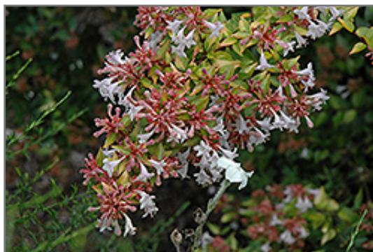
Frances Mason Abelia flowers

Frances Mason Abelia is recommended for the following landscape applications;