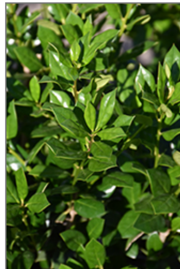
Needlepoint Chinese Holly foliage