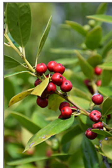
Needlepoint Chinese Holly fruit