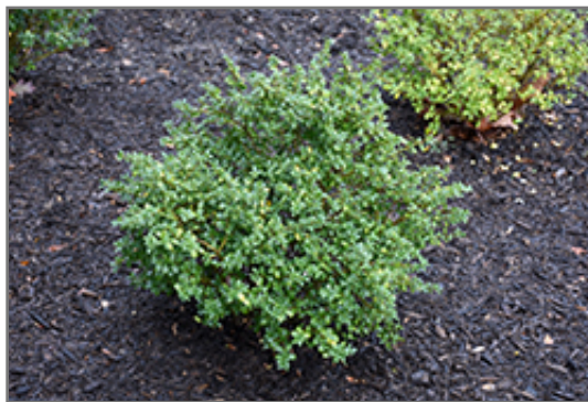
Green Lustre Japanese Holly