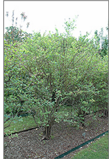
Climax Rabbiteye Blueberry

This shrub is typically grown in a designated area of the yard because of its mature size and spread. It does best in full sun to partial shade. It does best in average to evenly moist conditions, but will not tolerate standing water. It is very fussy about its soil conditions and must have sandy, acidic soils to ensure success, and is subject to chlorosis (yellowing) of the foliage in alkaline soils. It is quite intolerant of urban pollution, therefore inner city or urban streetside plantings are best avoided, and will benefit from being planted in a relatively sheltered location. Consider applying a thick mulch around the root zone in winter to protect it in exposed locations or colder microclimates. This is a selection of a native North American species.