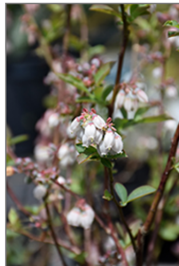
Climax Rabbiteye Blueberry flowers