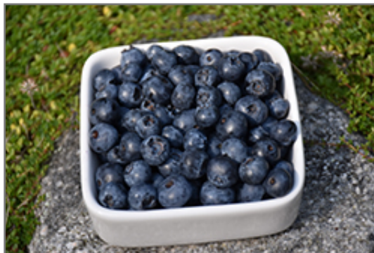
Climax Rabbiteye Blueberry fruit

Climax Rabbiteye Blueberry features dainty clusters of white bell-shaped flowers hanging below the branches in early spring. It has dark green deciduous foliage. The glossy oval leaves turn an outstanding scarlet in the fall. It features an abundance of magnificent blue berries from late spring to early summer.