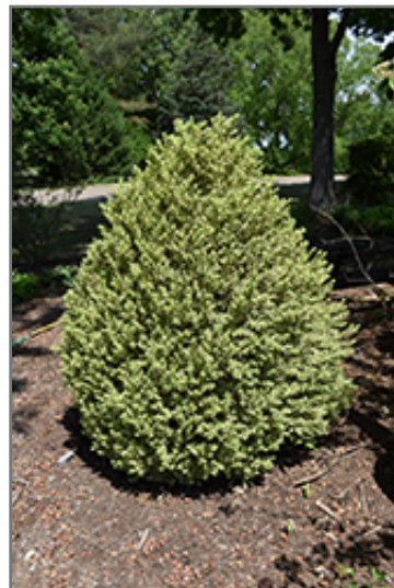
Variegated Boxwood