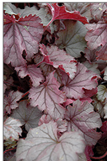
Little Cuties Sugar Berry Coral Bells foliage

Little Cuties Sugar Berry Coral Bells is recommended for the following landscape applications;