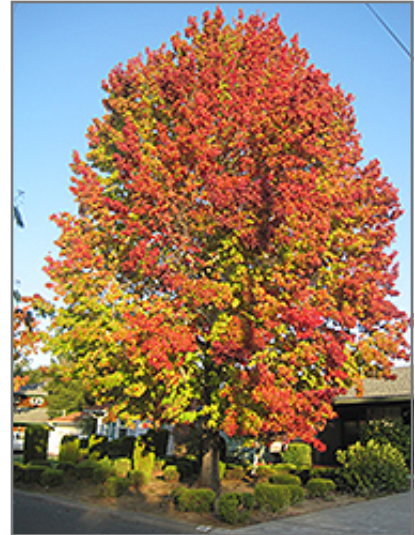
Lane RobertsSweet Gum in fall

Lane RobertsSweet Gum is recommended for the following landscape applications;