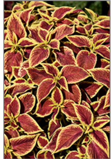
Premium Sun Crimson Gold Coleus foliage

Premium Sun Crimson Gold Coleus is recommended for the following landscape applications;