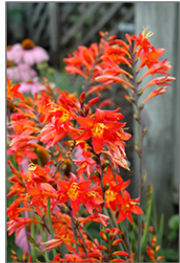
Prince Of Orange Crocosmia flowers

Prince Of Orange Crocosmia is recommended for the following landscape applications;