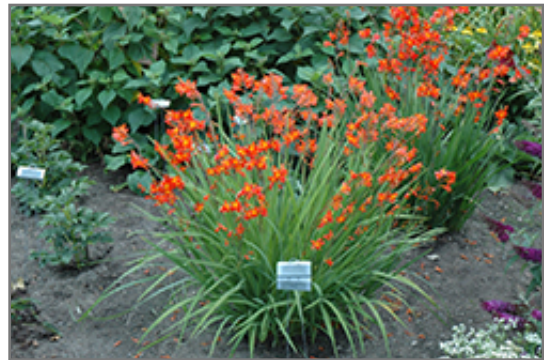
Prince Of Orange Crocosmia in bloom