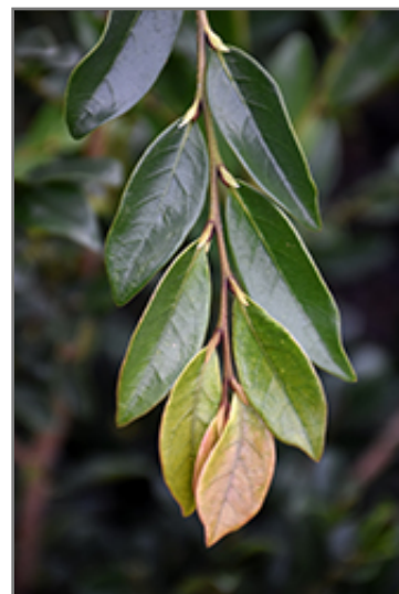
Linebacker Evergreen Distylium foliage

Linebacker Evergreen Distylium is recommended for the following landscape applications;