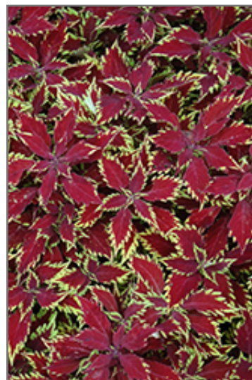
ColorBlaze Royale Apple Brandy Coleus foliage