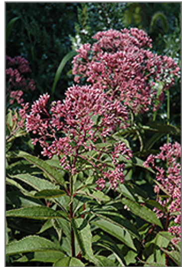
Gateway Joe Pye Weed flower buds

Gateway Joe Pye Weed is an herbaceous perennial with an upright spreading habit of growth. Its wonderfully bold, coarse texture can be very effective in a balanced garden composition.