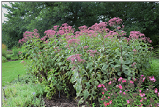
Gateway Joe Pye Weed in bloom