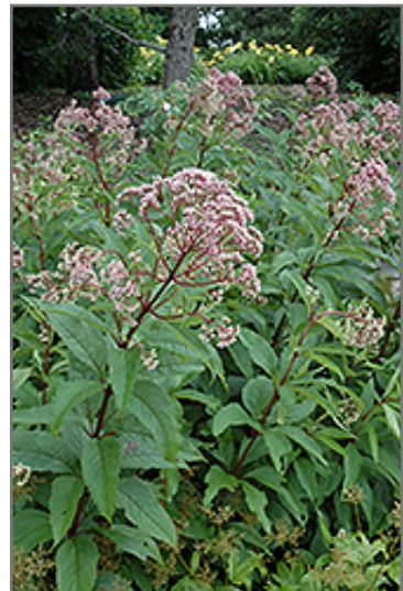
Gateway Joe Pye Weed flowers