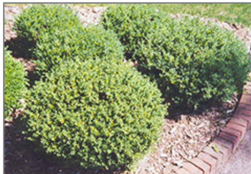
Japanese Boxwood