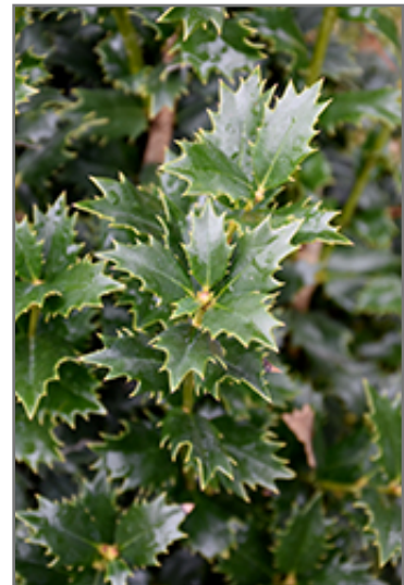
Acadiana Holly foliage