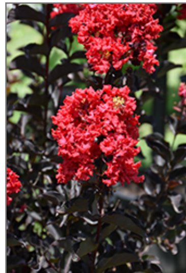
Ebony Fire Crapemyrtle flowers