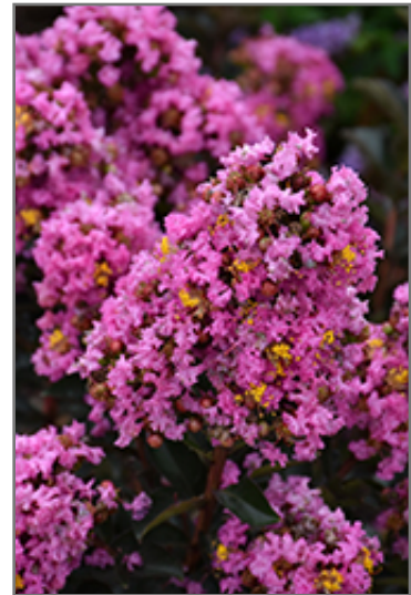
Barista Sweet Macchiato Crapemyrtle flowers

Barista Sweet Macchiato Crapemyrtle is recommended for the following landscape applications;