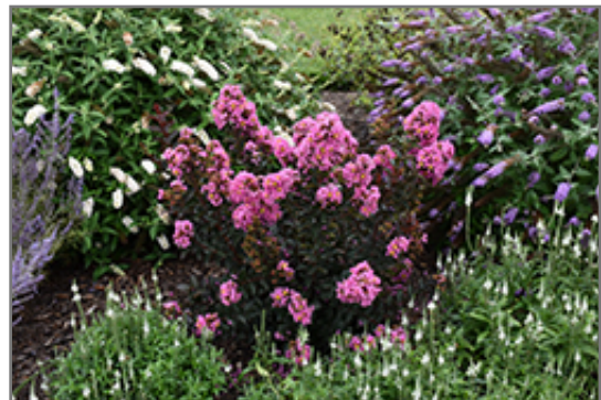
Barista Sweet Macchiato Crapemyrtle in bloom