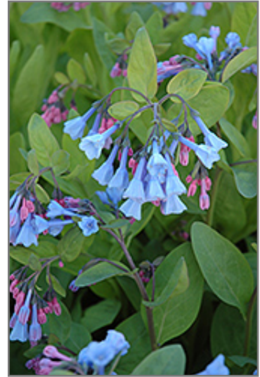
Virginia Bluebells flowers