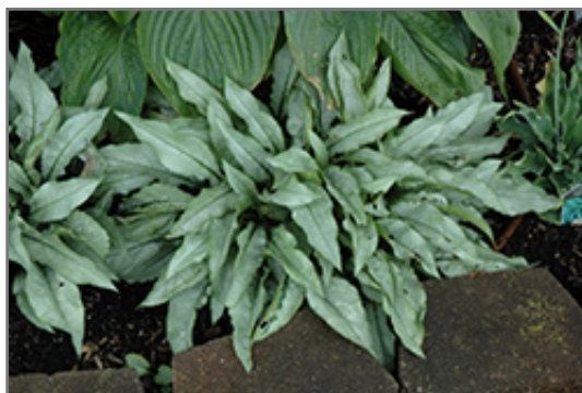
Majeste Lungwort