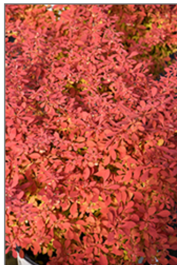
Sunjoy Neo Japanese Barberry foliage

Sunjoy Neo Japanese Barberry is recommended for the following landscape applications;