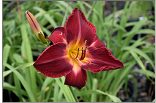
Red Volunteer Daylily flowers