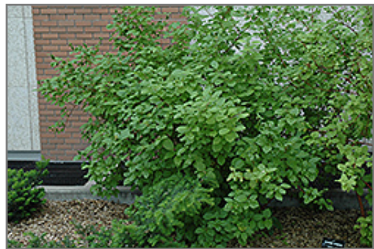
Siberian Dogwood