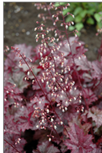
Amethyst Mist Coral Bells flowers