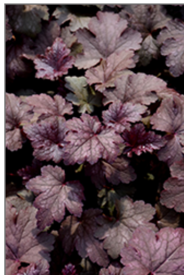
Amethyst Mist Coral Bells foliage

Amethyst Mist Coral Bells is recommended for the following landscape applications;