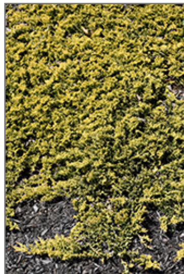
Mother Lode Juniper foliage