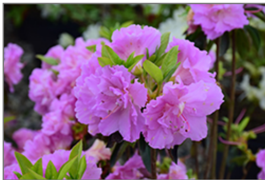
Elsie Lee Azalea flowers