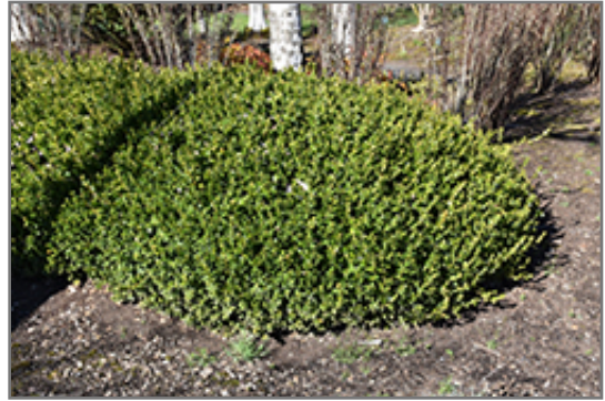
Winter Gem Boxwood