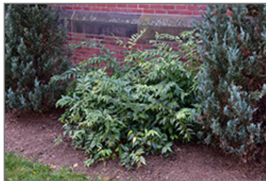
Rainbow Fetterbush