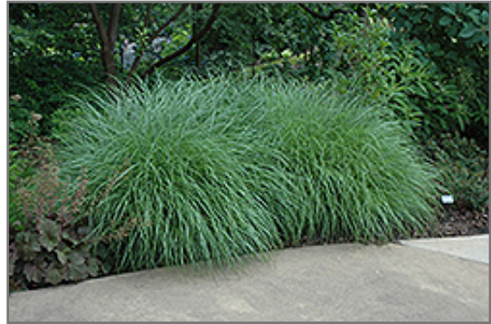
Little Kitten Dwarf Maiden Grass

Little Kitten Dwarf Maiden Grass is recommended for the following landscape applications;