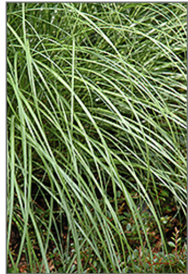
Little Kitten Dwarf Maiden Grass foliage