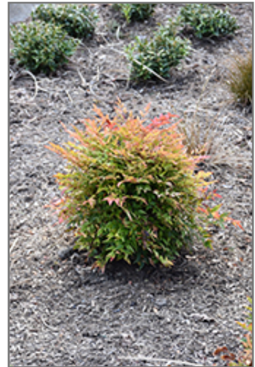
Gulf Stream Dwarf Nandina

Gulf Stream Dwarf Nandina is recommended for the following landscape applications;