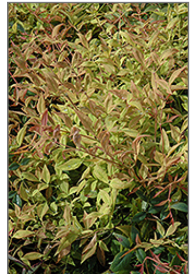
Gulf Stream Dwarf Nandina foliage