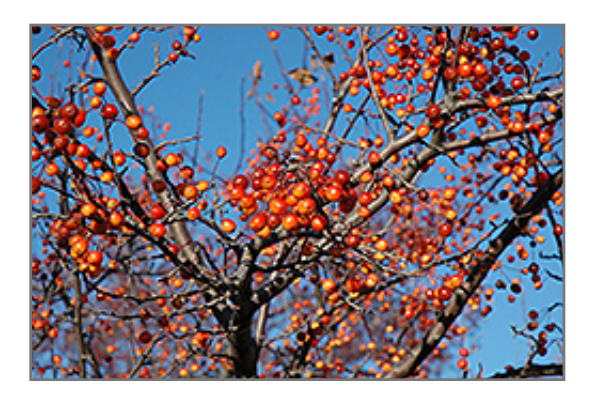
Indian Magic Flowering Crab fruit

This tree should only be grown in full sunlight. It prefers to grow in average to moist conditions, and shouldn't be allowed to dry out. It is not particular as to soil type or pH. It is highly tolerant of urban pollution and will even thrive in inner city environments. This particular variety is an interspecific hybrid.