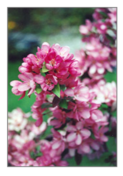
Indian Magic Flowering Crab flowers