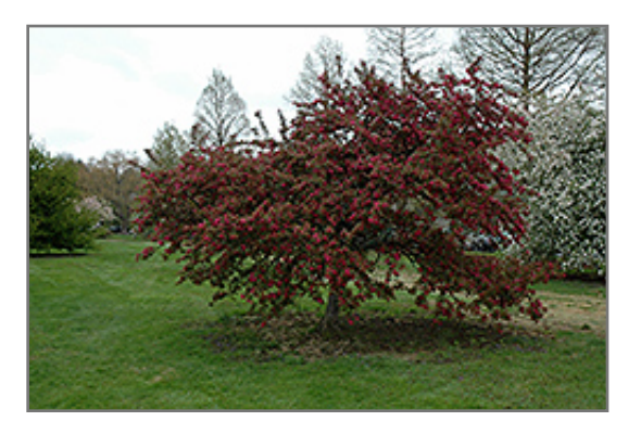
Indian Magic Flowering Crab in bloom