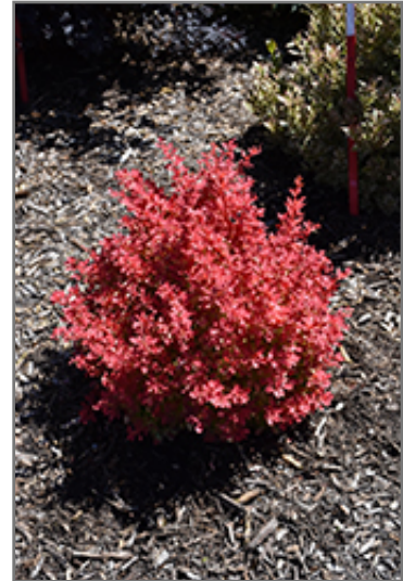
Sunjoy Neo Japanese Barberry

Sunjoy Neo Japanese Barberry makes a fine choice for the outdoor landscape, but it is also well-suited for use in outdoor pots and containers. It can be used either as 'filler' or as a 'thriller' in the 'spiller-thriller-filler' container combination, depending on the height and form of the other plants used in the container planting. It is even sizeable enough that it can be grown alone in a suitable container. Note that when grown in a container, it may not perform exactly as indicated on the tag - this is to be expected. Also note that when growing plants in outdoor containers and baskets, they may require more frequent waterings than they would in the yard or garden.