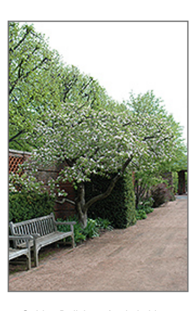
Golden Delicious Apple in bloom

This tree is typically grown in a designated area of the yard because of its mature size and spread. It should only be grown in full sunlight. It prefers to grow in average to moist conditions, and shouldn't be allowed to dry out. It is not particular as to soil type or pH. It is highly tolerant of urban pollution and will even thrive in inner city environments. This particular variety is an interspecific hybrid.