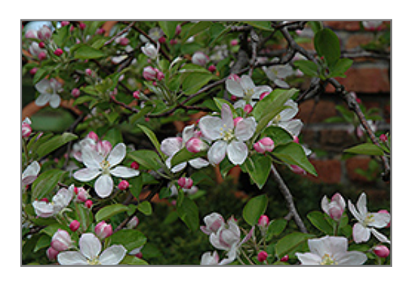
Golden Delicious Apple flowers