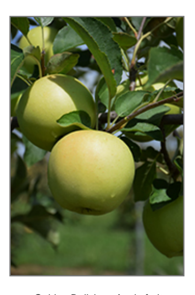
Golden Delicious Apple fruit

Golden Delicious Apple features showy clusters of lightly-scented white flowers with shell pink overtones along the branches in mid spring, which emerge from distinctive pink flower buds. It has forest green deciduous foliage. The pointy leaves turn yellow in fall. The fruits are showy chartreuse apples with yellow overtones, which are carried in abundance in mid fall. The fruit can be messy if allowed to drop on the lawn or walkways, and may require occasional clean-up.