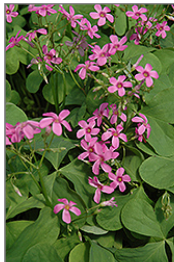
Pink Wood Sorrel flowers