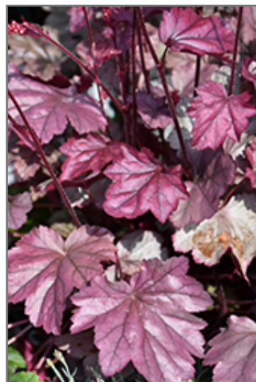
Stainless Steel Coral Bells foliage