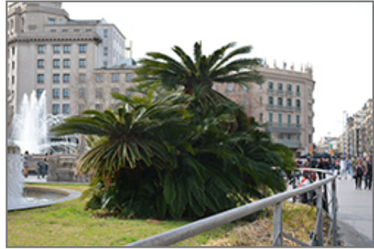
Japanese Sago Palm

Japanese Sago Palm is a fine choice for the garden, but it is also a good selection for planting in outdoor pots and containers. Because of its height, it is often used as a 'thriller' in the 'spiller-thriller-filler' container combination; plant it near the center of the pot, surrounded by smaller plants and those that spill over the edges. It is even sizeable enough that it can be grown alone in a suitable container. Note that when growing plants in outdoor containers and baskets, they may require more frequent waterings than they would in the yard or garden.