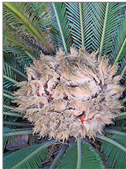
Japanese Sago Palm flowers