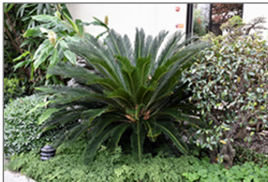
Japanese Sago Palm

This plant does best in full sun to partial shade. It does best in average to evenly moist conditions, but will not tolerate standing water. It is not particular as to soil pH, but grows best in sandy soils. It is somewhat tolerant of urban pollution. Consider applying a thick mulch around the root zone in winter to protect it in exposed locations or colder microclimates. This species is not originally from North America, and parts of it are known to be toxic to humans and animals, so care should be exercised in planting it around children and pets.