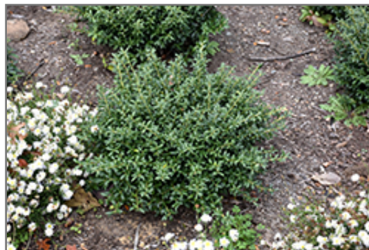
Soft Touch Japanese Holly