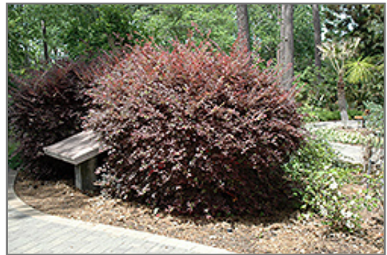
Daruma Chinese Fringeflower