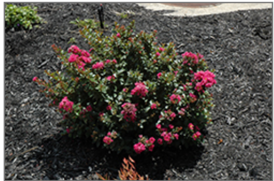
Berry Dazzle Crapemyrtle in bloom