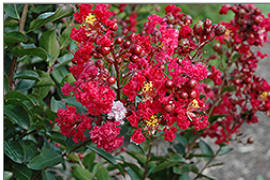
Red Rooster Crapemyrtle flowers

Red Rooster Crapemyrtle is recommended for the following landscape applications;