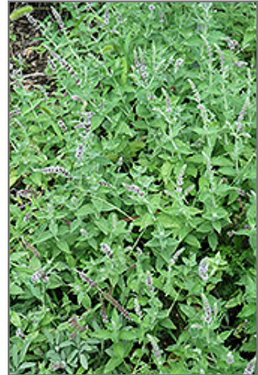
Pennyroyal in bloom