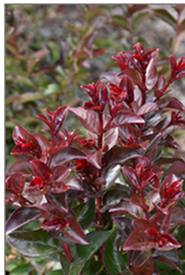
Cherry Mocha Crapemyrtle foliage

Cherry Mocha Crapemyrtle makes a fine choice for the outdoor landscape, but it is also well-suited for use in outdoor pots and containers. With its upright habit of growth, it is best suited for use as a 'thriller' in the 'spiller-thriller-filler' container combination; plant it near the center of the pot, surrounded by smaller plants and those that spill over the edges. It is even sizeable enough that it can be grown alone in a suitable container. Note that when grown in a container, it may not perform exactly as indicated on the tag - this is to be expected. Also note that when growing plants in outdoor containers and baskets, they may require more frequent waterings than they would in the yard or garden.