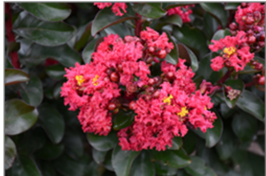
Cherry Mocha Crapemyrtle flowers

This shrub will require occasional maintenance and upkeep. Trim off the flower heads after they fade and die to encourage more blooms late into the season. It is a good choice for attracting bees to your yard, but is not particularly attractive to deer who tend to leave it alone in favor of tastier treats. It has no significant negative characteristics.