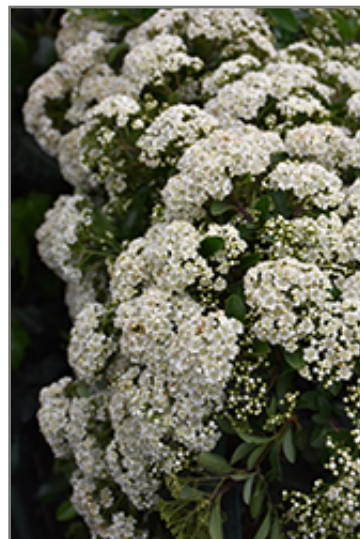
Mohave Firethorn flowers