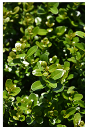
Sprinter Boxwood foliage