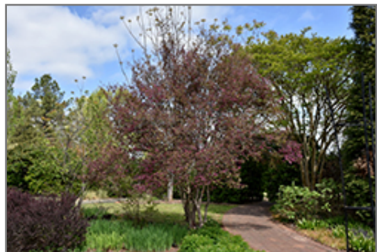
Zhuzhou Fuchsia Chinese Fringeflower in bloom