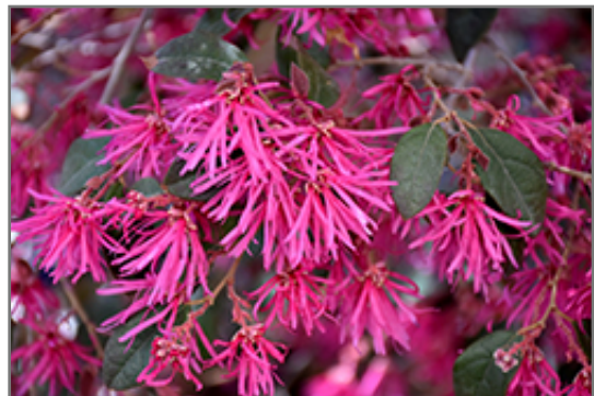
Zhuzhou Fuchsia Chinese Fringeflower flowers

This is a relatively low maintenance shrub, and should only be pruned after flowering to avoid removing any of the current season's flowers. It has no significant negative characteristics.