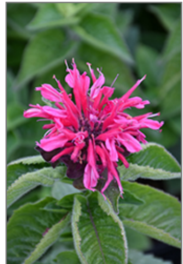
Bee-You Bee-Merry Beebalm flowers