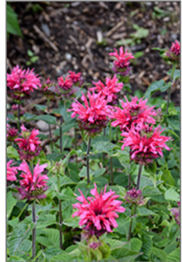
Bee-You Bee-Merry Beebalm flowers