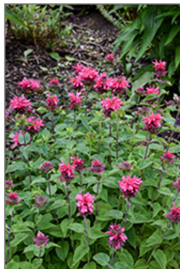
Bee-You Bee-Merry Beebalm in bloom

* This is a 'special order' plant - contact store for details